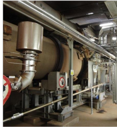
Picture 9: The granulate with more than 90 percent dry matter is burned in the downstream thermal utilisation plant.