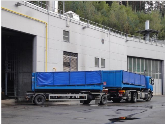
Picture 1: Every week, the ARA Tobl sewage plant processes 40 containers full of sewage sludge.