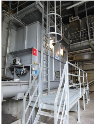
Picture 7: The low-temperature belt dryer is framed by reinforced concrete.