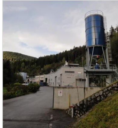
Picture 2-3: ARA Tobl – the whole wastewater treatment is underground.