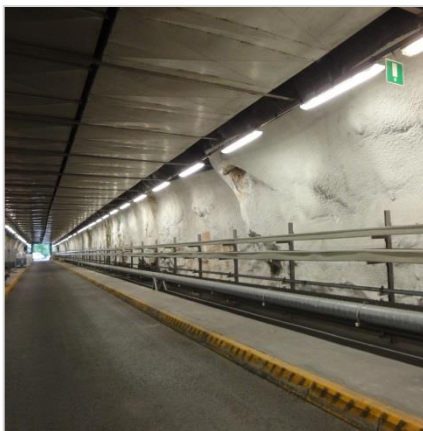
Picture 4-5: About 1,100 litres wastewater flow into the plant every second.

Ursula Herrling-Tusch Charlottenburger Allee 27-29 D-52068 Aachen Tel: +49 [0] 241 / 1 89 25-10 Fax: +49 [0] 241 / 1 89 25-29 E-Mail: herrling-tusch@impetus-pr.de