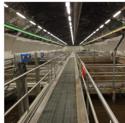
Picture 6: In the side tunnels, the heavy sludge is separated over an average retention time of 90 minutes.