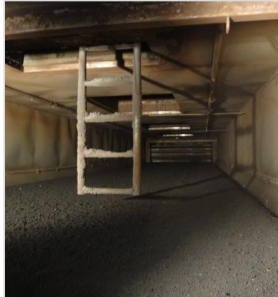
Picture 8: About 75,000 kilograms of sludge are loaded onto the PPS 5099 belt every day at the ARA Tobl sewage works.