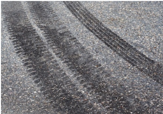
Picture 7: According to the German Federal Environmental Agency up to 111,000 tonnes of tire abrasion materials are produced each year in Germany alone.